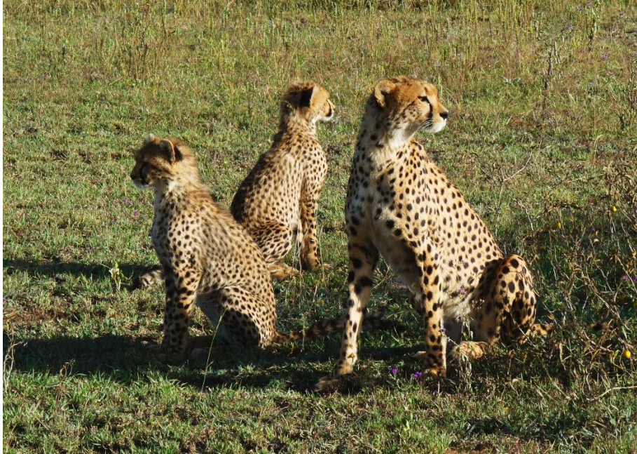
Mother cheetah with two cubs in the Ngorongoro Conservation Area, Tanzania.

There are about 7,100 wild cheetahs left in the world in scattered populations in Africa and one, very small and possibly unviable population in Iran. The speed king of the cat family is fast disappearing and now only inhabits nine per cent of its former range across Africa, the Middle East, Central Asia and South Asia.