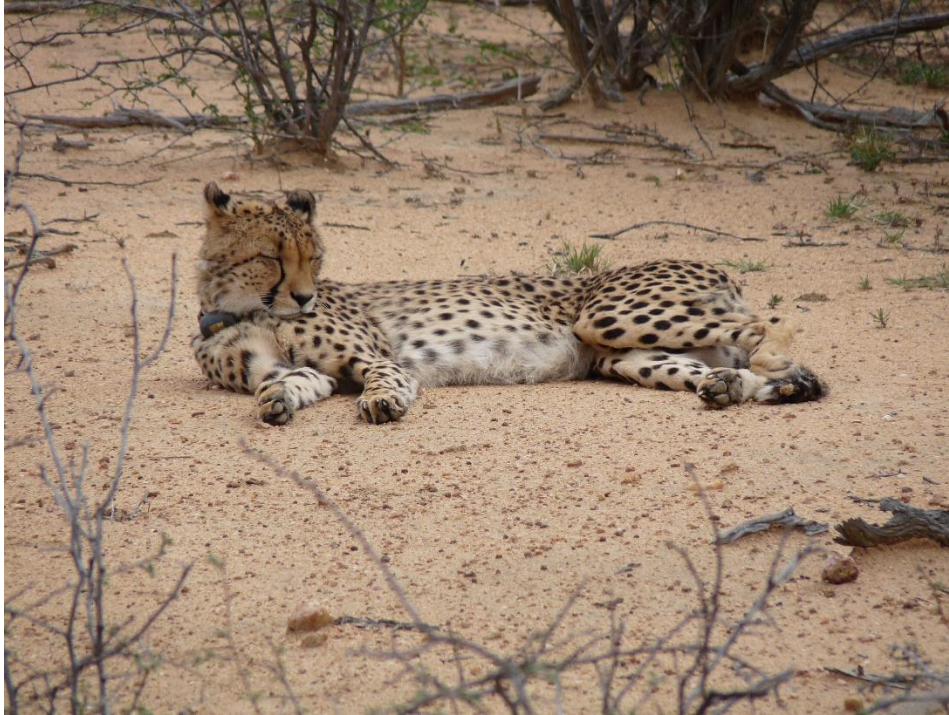
A cheetah rescued after its mother was killed and relocated to Africat's Okonjima Reserve.

Helping avoid conflict between cheetahs and farmers is vital as 90 per cent of Namibia's cheetahs live on unprotected land, most of it potential or actual grazing land. Conflict with farmers is one of the most prevalent causes of cheetah deaths and is the main threat to the successes achieved since 1990 in restoring cheetah numbers and encouraging tolerance by farmers of predators.